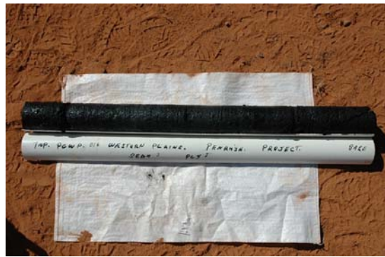
Seam 3 Ply 1

The Penrhyn coal project is intended to form part of the proposed joint venture with Evergreen Energy Inc (NYSE Arca:EEE) that was announced on 3 February 2011. Under the terms of the present MOU agreement, the JV will have the rights to the first 15 mtpa of upgraded coal produced anywhere in Australia using Evergreen's K-Fuel process. After the first 15mtpa, the JV will have the first right to participate in new coal upgrading projects that Evergreen undertakes in Australia on terms to be negotiated in good faith at the time.